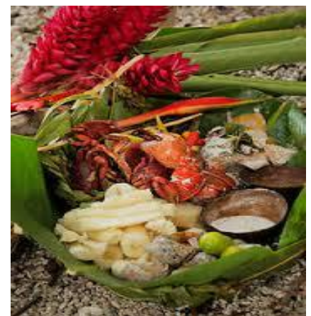
Christmas in the Pacific Islands

On behalf of the Cross Cultural Interest group.