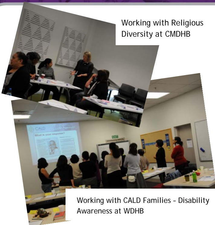
Working with Religious Diversity at CMDHB