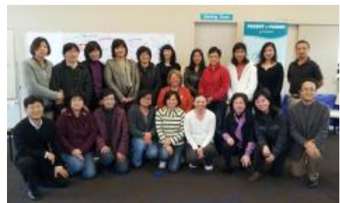
All together: Workshop leaders and participants come together.

The first workshop was held on August 7, with the conversation topic 'Creating a vision of the good life'. The second session was held on September 25 and the topic was 'The gifts we bring, the contributions we make'. The final session will be held on 24 October.