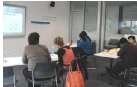
Participants at the CALD 8 training course discuss the New Zealand Disability Strategy 2001

The CALD 8 training module is also available as both a face-to-face and an E-learning course. Prerequisites are CALD 1 Cultural and Cultural Competency and CALD 2 Working with migrant patients. Go to www.caldresources.org to register.